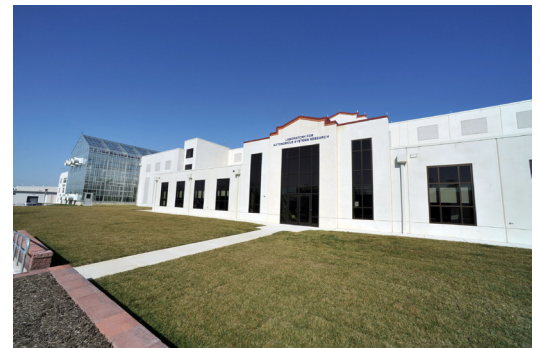
Naval Research Laboratory

DoD will pursue the following goals and objectives to address the global spectrum challenges that face DoD today and at least through 2020. A significant part of this strategy requires advancing and adopting spectrum-dependent technologies that will lead to more spectrally efficient, flexible, and adaptable SDS capabilities. DoD will explore promising technologies, assess the technologies' military utility, and include the most promising in key acquisition programs. DoD will also continue to adopt new tools and techniques to manage the spectrum more effectively, making our spectrum operations more agile. Finally, DoD must improve its understanding and assessment of proposed regulatory and policy changes, and the associated impacts, to arrive at informed decisions that balance national defense and security with economic interests.