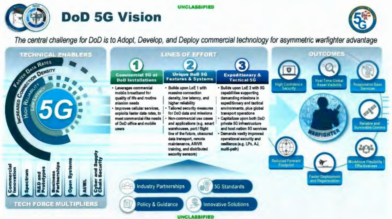
Figure 1 - DoD 5G Vision

Deploying 5G requires a unique planning approach, where the Department must not only protect against today's threats but transform the future network so that it is mission-tailored, integrated across the Joint Force, and cyber-resilient. This strategy identifies key activities to facilitate, synchronize, and govern the implementation and operation of private fifth generation (5G) networks, as defined by 3 rd Generation Partnership Project (3GPP), at military installations. To fully align with DoD's 5G Vision (Figure 1), the deployment and management of 5G networks in any of the lines of effort require effective governance mechanisms to ensure successful implementation.